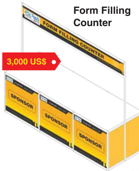
Form Filling Counter